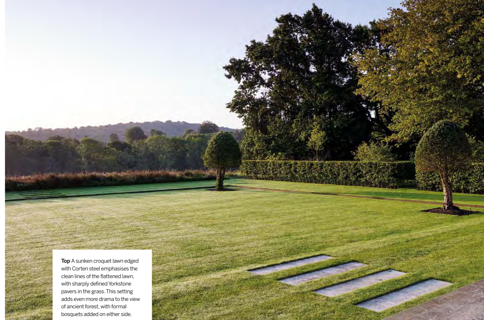
Top A sunken croquet lawn edged with Corten steel emphasises the clean lines of the flattened lawn, with sharply defined Yorkstone pavers in the grass. This setting adds even more drama to the view of ancient forest, with formal bosquets added on either side.