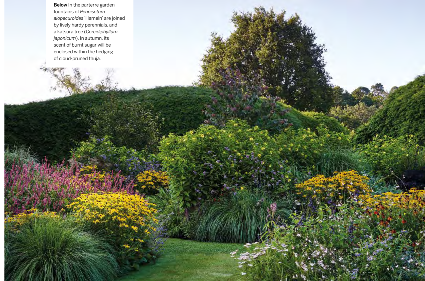
Below In the parterre garden fountains of Pennisetum alopecuroides 'Hameln' are joined by lively hardy perennials, and a katsura tree ( Cercidiphyllum japonicum ). In autumn, its scent of burnt sugar will be enclosed within the hedging of cloud-pruned thuja.