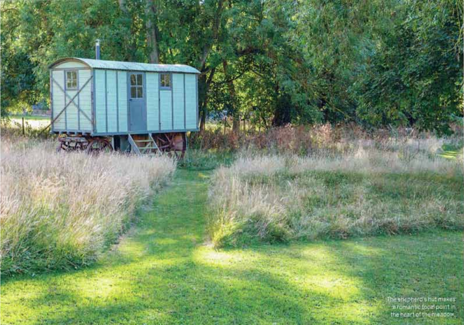
The shepherd's hut makes a romantic focal point in the heart of the meadow.

and the installation of a rain-water fed irrigation system. At the end of these borders, a gap in the formal hedge frames a contrasting view of a nascent orchard and meadow, where a painted shepherd's hut sits in a haze of wild flowers.